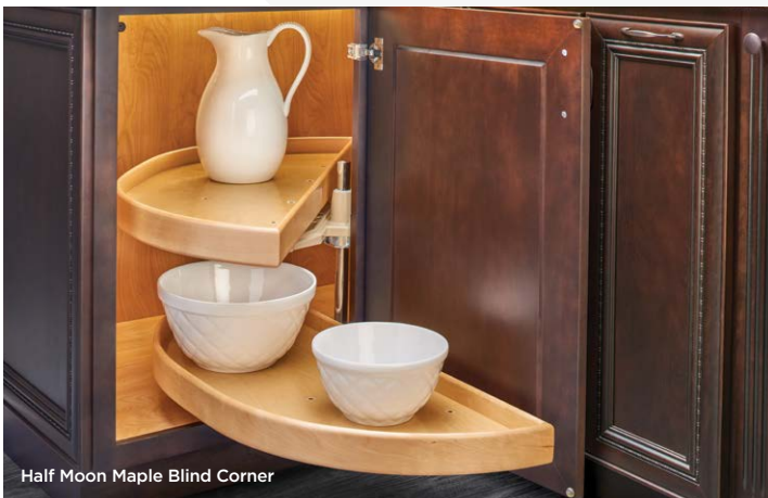
Half Moon Maple Blind Corner