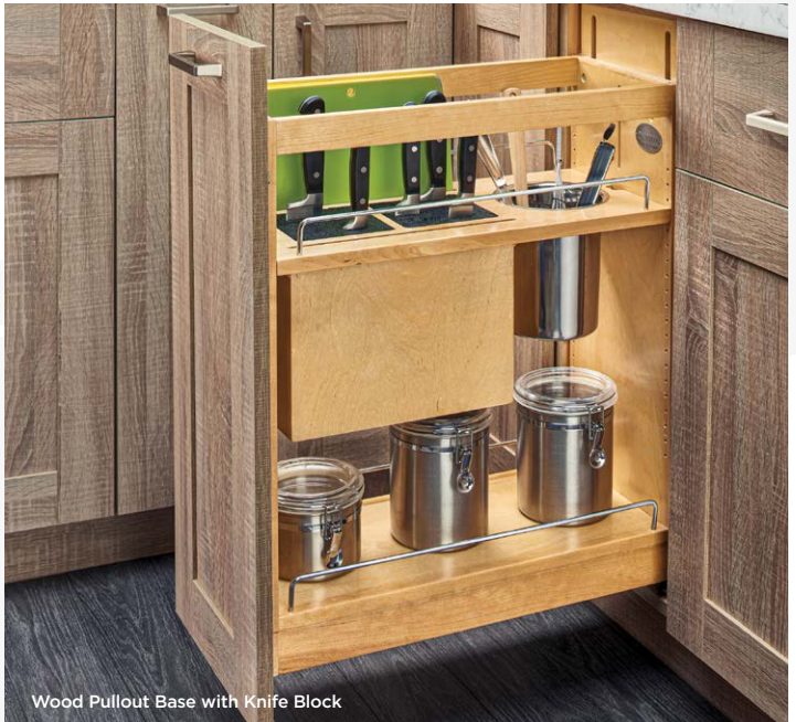
Wood Pullout Base with Knife Block