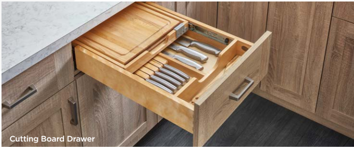
Cutting Board Drawer