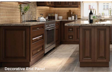
Decorative End Panel

From subtle enhancements to personalized touches bursting with character, we have you covered, creating the perfect kitchen space to enjoy.