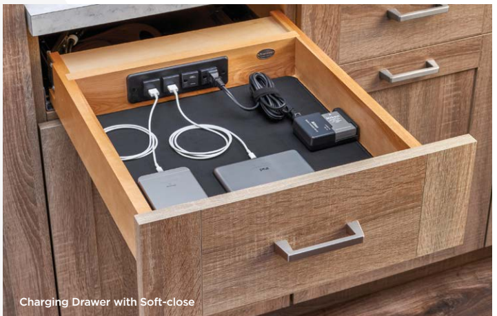
Charging Drawer with Soft-close

Cabinets featured in these images are primarily a backdrop to showcase the new accessories and may not fully represent Innovation Cabinetry's current offering.