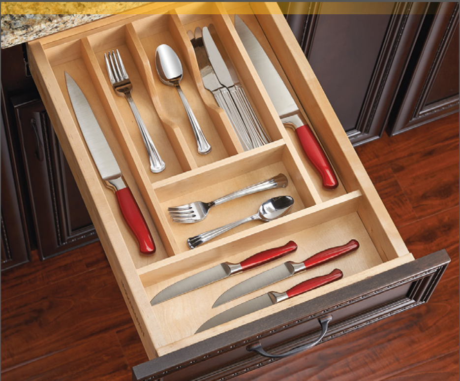
Wood Cutlery Tray Insert