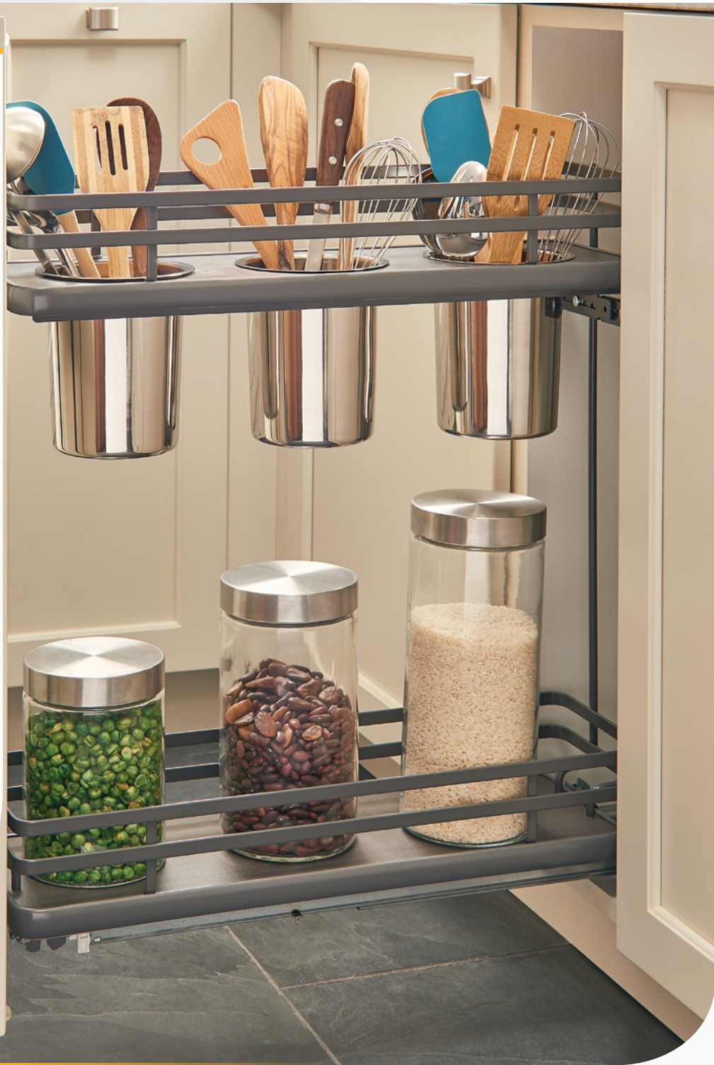
Full Access Contemporary Base Cabinet Pullout w/ (3) Utensil Bins and BLUM Soft-Close