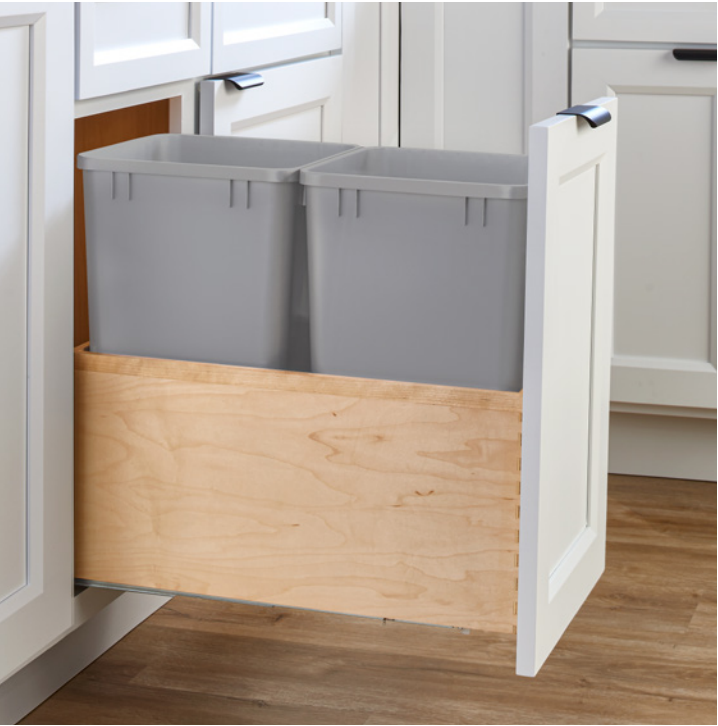
Value Line Bottom Mount Waste Container Drawer Box w/ Soft-Close Slides