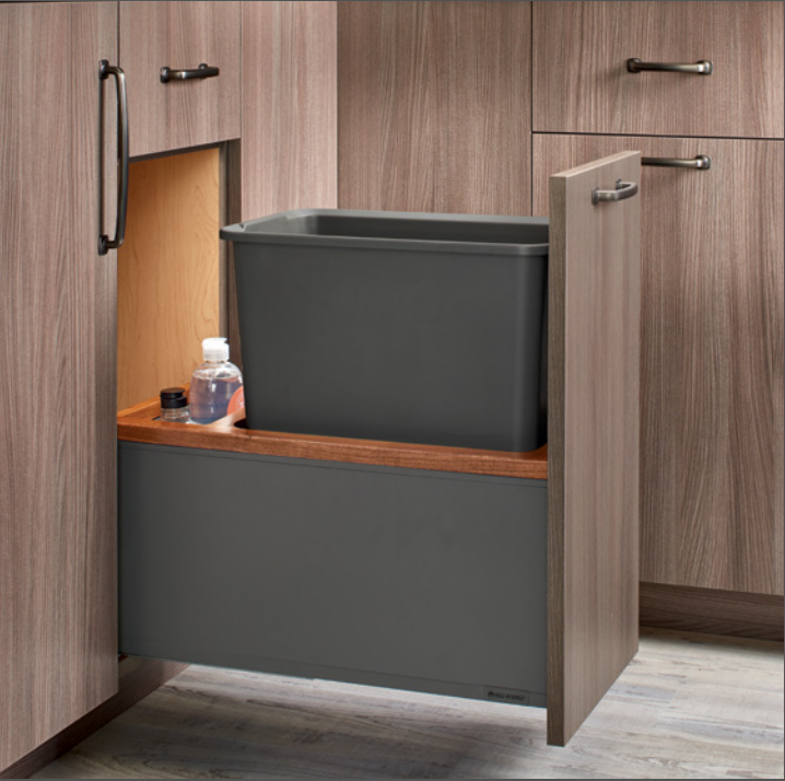
LEGRABOX Bottom Mount Waste Container Pullouts w/ Soft-Close