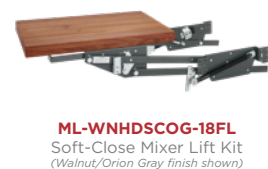
ML-WNHDSCOG-18FL Soft-Close Mixer Lift Kit (Walnut/Orion Gray finish shown)

Shelf Dimensions Walnut (full access): 13-1/4" (336 mm) W x 20" (508 mm) D x 1-3/8" (35 mm) H Note: Shelves are only sold in kits with the mixer lift.