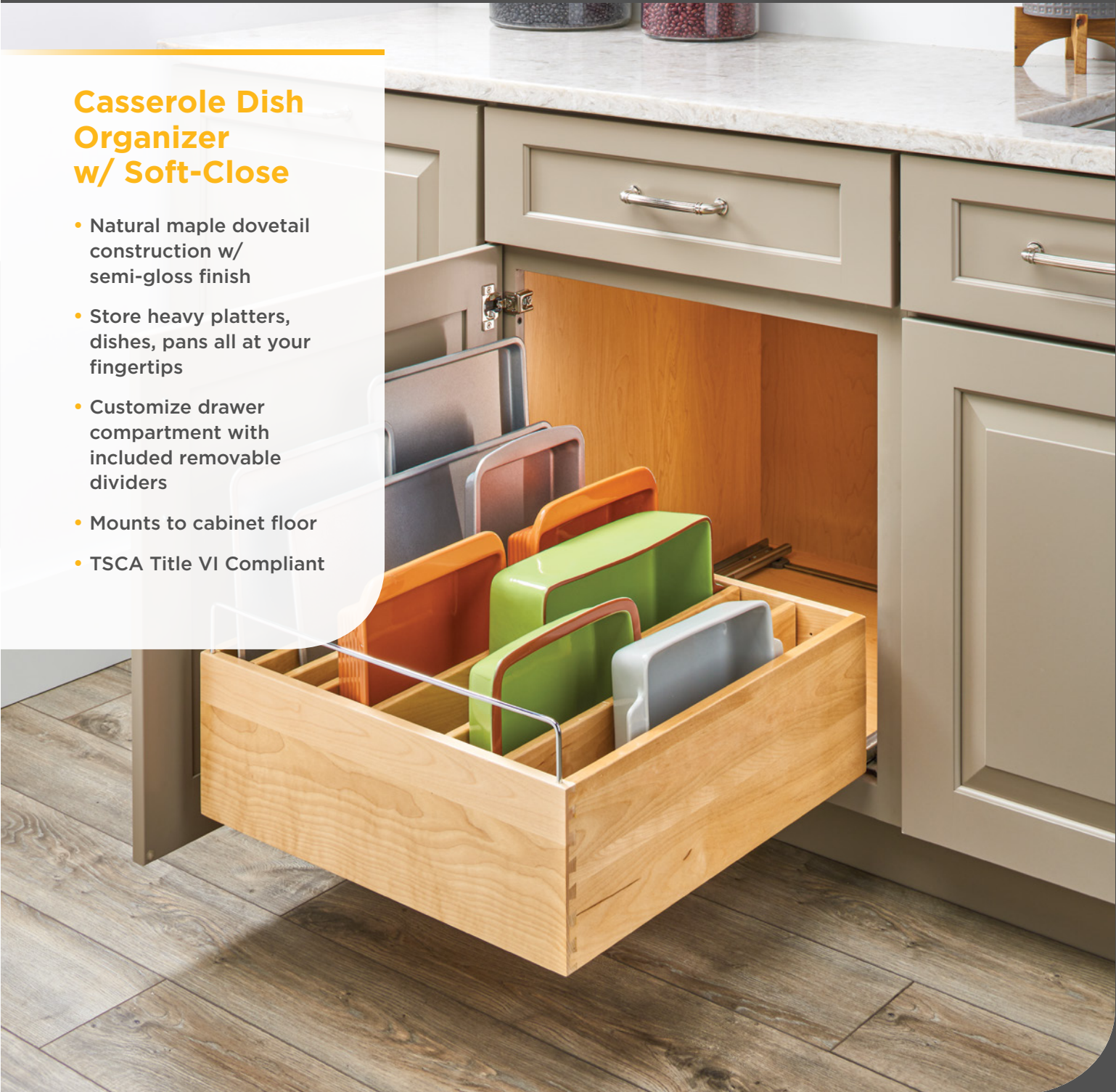
Casserole Dish Organizer w/ BLUM Soft-Close