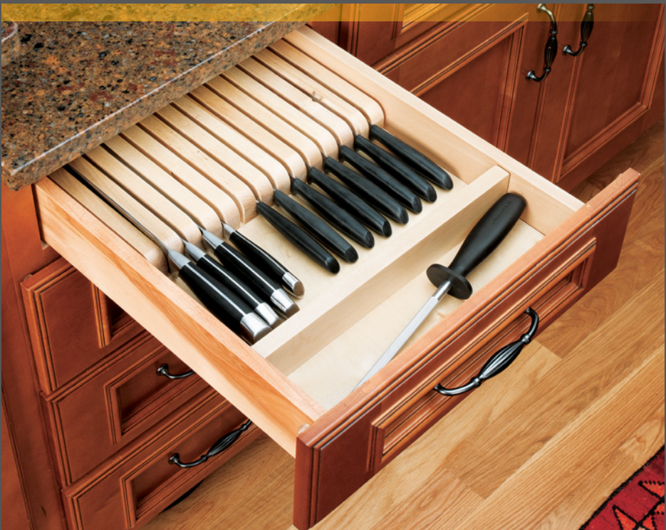
Wood Knife Block Insert